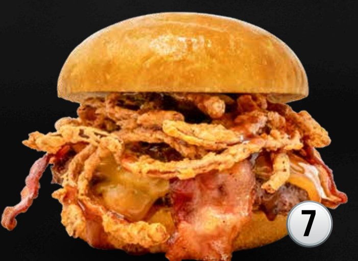
*KICKIN' BOURBON BACON CHEESEBURGER

Pecan Wood Smoked Bacon (2), Avocado, Lettuce, Tomato, Red Onion, Pickle & Avocado Ranch