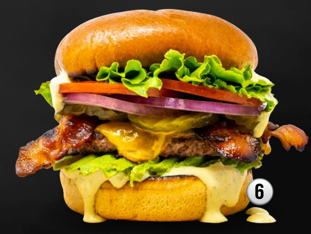
*CALI CHEESEBURGER $17

Grilled Pineapple, Lettuce, Tomato, Red Onion & Teriyaki Glaze